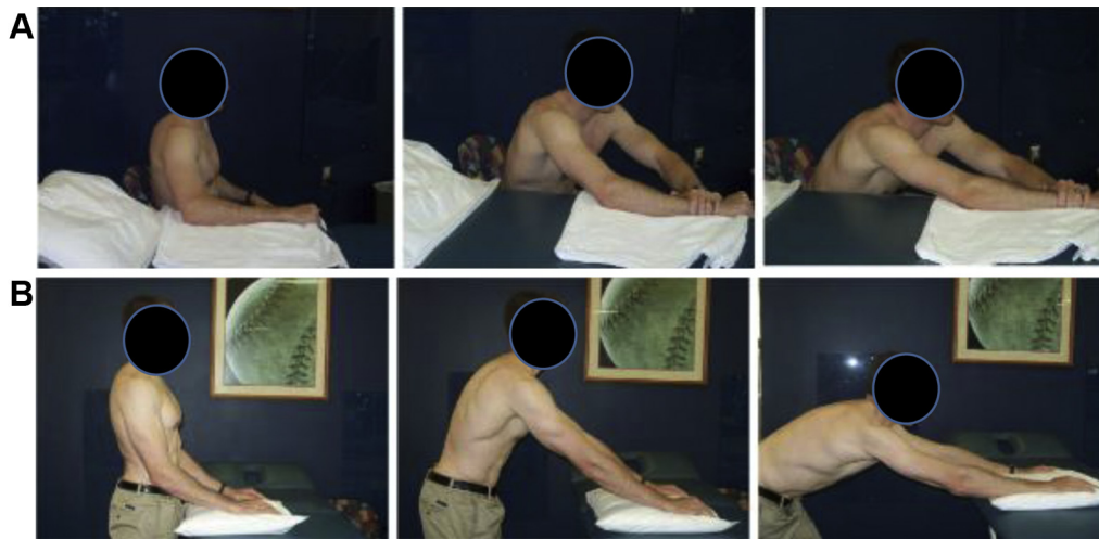
Figure 4 Passive elevation with (A) table slide and (B) table step back.

in a sling. Gentle Codman pendulum exercises are promoted in this phase as a method of shoulder muscle relaxation, joint fluid circulation, and improving passive ROM in elevation.