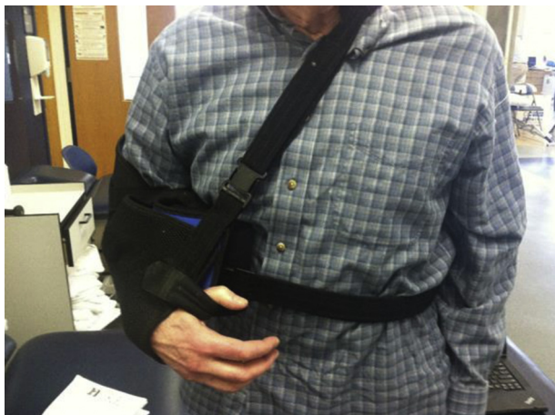
Figure 2 Sling with abduction pillow.

procedure. Following supra-pectoral and subpectoral biceps tenodesis, resisted elbow flexion and supination are avoided for the first 6 weeks following surgery. 33,40