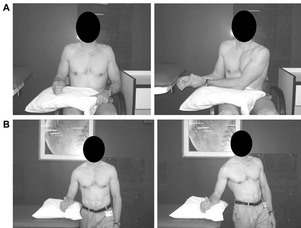
Figure 3 Passive methods for external rotation to 30° in phase 1 of rehabilitation: (A) assisted with the well arm and (B) by supported step-around.

the healing anterior joint capsule and SSc. 4,7 Methods of performing ER include well arm- or dowel-assisted motion in the seated or supine position, or resting the arm on a supportive surface such as a table or countertop and turning the torso slightly away (Fig. 2). The table step-around ER exercise illustrated in Figure 3 lessens inadvertent patient guarding or contraction of the SSc muscle during dowel-assisted ROM. The ASSET panel of experts agree that supine exercises soon after ATSA are challenging for patients because of the following reasons: (1) if the arm is not well supported in the plane of the scapula, there may be painful strain across the healing incision, anterior joint capsule, and SSc; (2) many patients are challenged with getting into and out of a supine position without weight bearing on the surgical arm; and (3) finding a place to sit to do ROM is likely more convenient than lying supine and may foster increased compliance with home exercises.