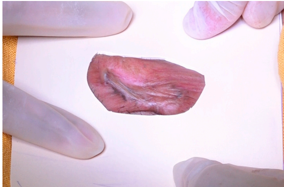
Fig 2. Disposable customizable template perfectly fitting the irregular-shaped keloid.

Polyurethane is an ideal thermoplastic substance that does not crack or stick to the skin that can be used as a cryoshield template. It is easily available in variable thicknesses (ranging from 3/16 to 1/4 inches) at hardware stores and online shopping sites (used in surgical room flooring). It is inexpensive, stretchable (can fit the lesion and contour of the body part), and bacteriostatic.