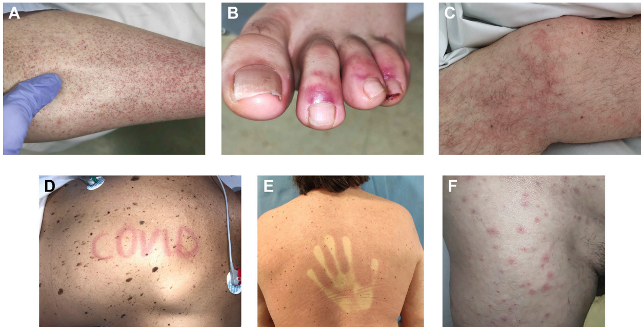
Fig 2. Examples of coronavirus disease 2019–associated rash with petechiae ( A ), acral ischemia ( B ), livedo reticularis subtype located on the lower extremities ( C ), urticarial rash ( D ), erythematous rash ( E ), and vesicular rash ( F ). Erythematous rash blanches on pressure, whereas rash with petechiae, livedo reticularis subtype, and acral ischemia does not. Urticarial rash may be associated with dermographism. Severe acute respiratory syndrome coronavirus 2 infection was confirmed in all the patients by reverse-transcriptase polymerase chain reaction assay.

after each step may be taken immediately afterward by the patient or medical staff so that lesions can be easily assessed by teler dermatology.