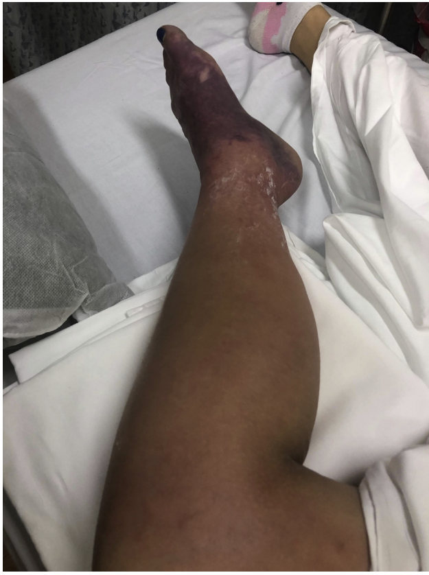
Figure 1. Severely swollen, painful, cyanotic left lower extremity on presentation.

Echocardiogram revealed severe right ventricular (RV) dilation with severe hypokinesia consistent with acute massive pulmonary embolism (PE). A multidisciplinary decision was made to initiate peripheral venoarterial extracorporeal membrane oxygenation (ECMO). Unfractionated heparin adjusted to an activated clotting time of 190-200 seconds was continued throughout the ECMO run. Given prolonged resuscitation of about 30-45 minutes, we initiated therapeutic hypothermia via the ECMO circuit. Admission SARS-CoV-2 nasopharyngeal reverse transcriptase-polymerase chain reaction testing was negative. Fibrinogen level drawn post ECMO initiation was 191 mg/dL (normal range, 210-400 mg/dL). Her initial thrombophilia workup was negative for most risk factors but was positive for antiphospholipid antibodies (APLA) (Table).