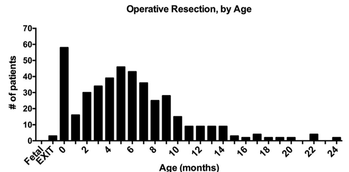
Fig. 2. Timing of resection (in months) among operative congenital lung malformations.